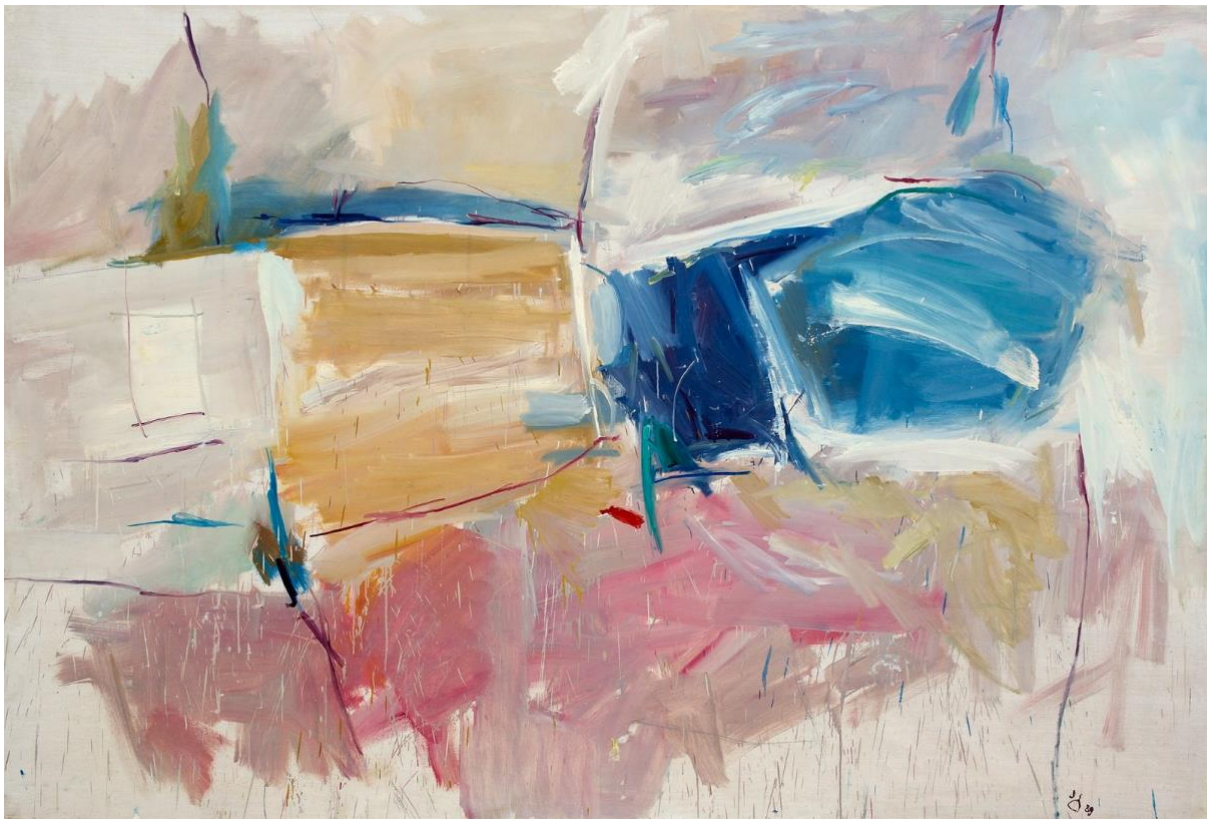
(Compositio, 1989, Alexandre Bandzeladze)

Bandzeladze's late non-figurative abstract paintings from the 1980s epitomize the synthesis of his artistic exploration and observations. In this period, he masterfully employed a soft palette and strategic use of color to create a harmonious yet contrasting visual experience. One notable piece from this period, "Dream by Drunk Noah," encapsulates Bandzeladze's inspiration drawn from religious motifs, weaving a narrative that transcends literal interpretation.