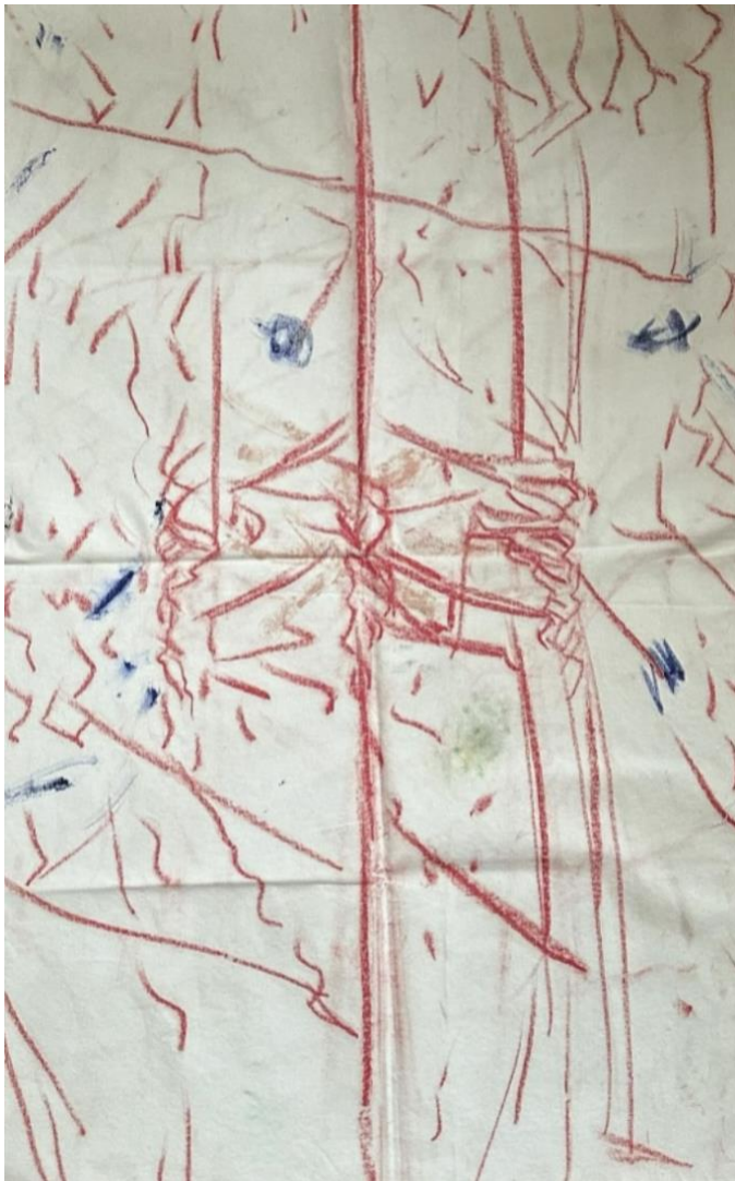
(Untitled, 2015, Oil stick on canvas, Tamuna Sirbiladze)

Sirbiladze's artistic oeuvre is distinguished by a unique style of abstraction that fuses expressive dynamism with an intimate sensitivity to form and color. Her abstract forms evoke a sense of organic fluidity, reminiscent of natural phenomena yet firmly rooted in the abstract. Exploring themes of sexuality and vulnerability, Sirbiladze's works stand as compelling testaments to the power of abstraction to convey the depths of human experience and emotion.